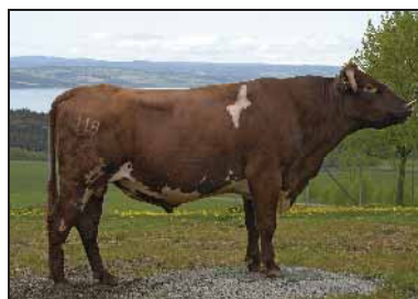
Hover: Hi Production and Protein %, Good Fertility