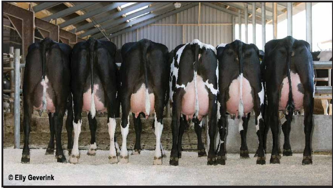
A group of functional, efficient Norwegian Red x Holsteins in the Netherlands.

As of April 1, Target Breeding has become Geno-UK. Over the past years we have promoted crossbreeding based on our belief that crossbreds will improve the health, reproductive performance and profitability of UK dairy farms.