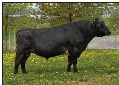
Hojo: Outstanding Production, plus High Fertility, medium

These bulls are heterozygous polled, meaning that 50% of the calves will be born polled. Calves born polled mean one less job for the dairyman and one less stress for the calf.