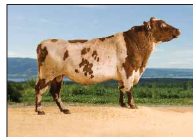
Askim: Good yields, Very High Fertility, Easy keeping cattle.

Interesting fact: At this time there are over dairy 600 farms with milking robots in Norway.